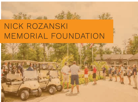
NICK ROZANSKI MEMORIAL FOUNDATION

“The Nick Rozanski Memorial Foundation has appreciated and benefitted from our relationship with the Dublin Community Foundation in many ways through the years. We feel very fortunate to have this partnership and we are looking forward to continuing to work with the Dublin Community Foundation.”