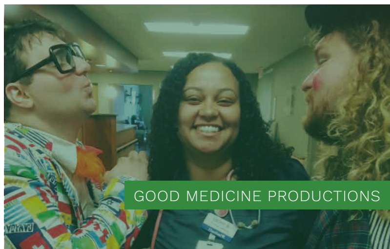
GOOD MEDICINE PRODUCTIONS

“In the last year, since partnering with the Dublin Community Foundation, our Good Medicine Senior Living Program was able to grow from serving one senior living facility in Dublin to three. Our Senior Living program brings in professional comedic performers bedside and uses physical comedy, improvisation, music and more to empower these seniors in places where they are often left powerless.”